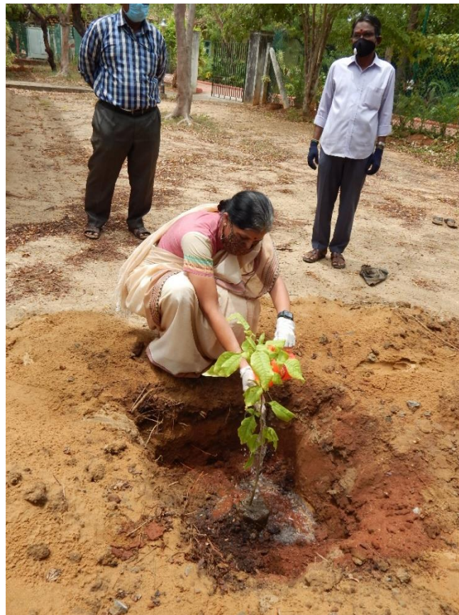
Director, Kalakshetra Foundation planting a sapling on the occasion of Sankalp Parv

Sankalp Parv 2020: As per the directions of the Ministry, Sankalp Parv was observed by the Foundation. 75 saplings were planted in the campus.