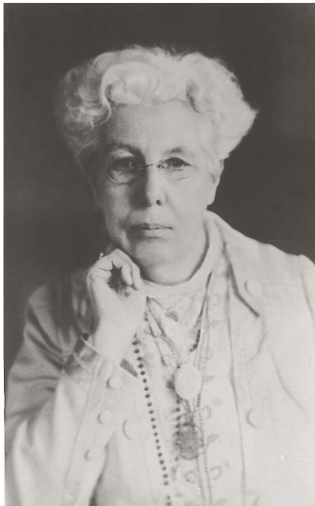
Dr. ANNIE BESANT (1847–1933)

“Be firm. Be strong, be self controlled; your feet are on the Rock of Ages and beyond the drifting clouds, shines the STAR”