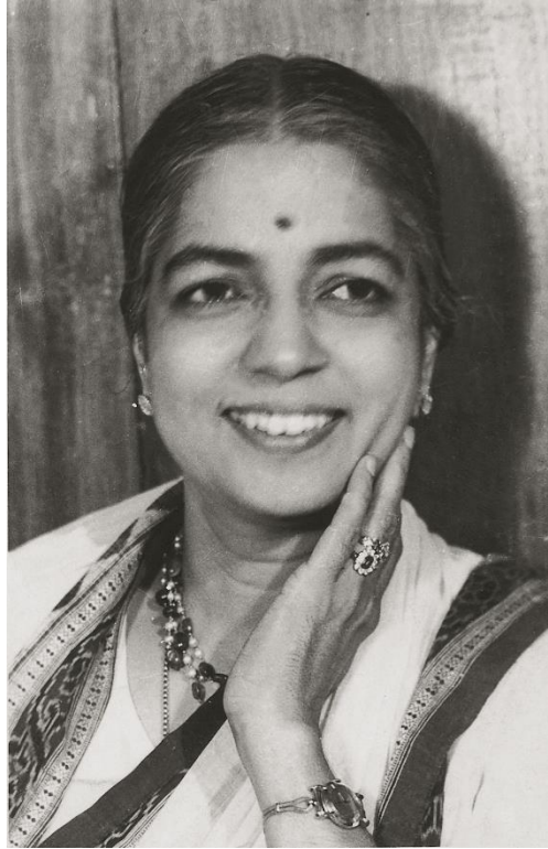
Smt. RUKMINI DEVI (1904 – 1986)

There is nothing greater in life than inspiration. If you can inspire people, you are really fulfilling life and the fulfilling of life is our goal